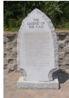
Alton is home to the local legend of the Piasa Bird.

The $14.4 million facility is approximately 1.5 miles northwest of the previous station. Construction costs for the station and platform were funded by a federal grant to the Illinois Department of Transportation as part of the improvements being made to the Chicago-to-St. Louis corridor leading to increased safety, reliability, passenger comfort as well as a decrease in travel time. A federal Transportation Investment Generating Economic Recovery grant obtained by the City of Alton covered the cost to construct the remainder of the site, including parking, the new Madison County Transit transfer hub and connections to a local trail network for bicyclists and pedestrians.