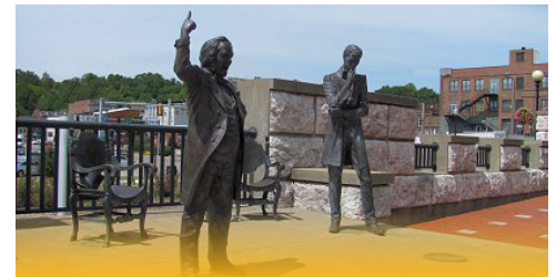
The seventh and last congressional debate between Abraham Lincoln and Stephen Douglas was held in Alton in 1858.

..... Before the Civil War, Alton was an important town for abolitionists, and was part of the Underground Railroad.